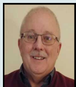
John Saunders Communications