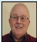
John Saunders Communications