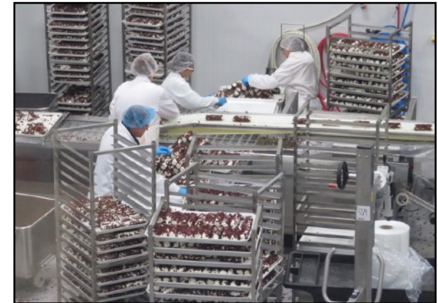
Mariposa Dairy Tour