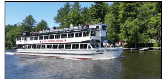
Lady Muskoka Boat Tour