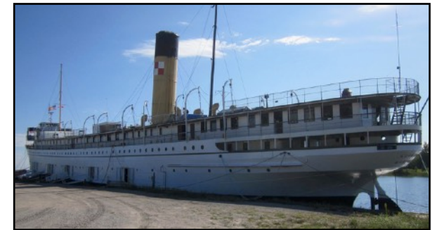
Keewatin Cruise Ship Tour