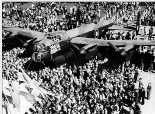
The Ruhr Express Canada’s 1st Lancaster Bomber