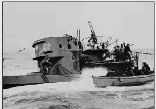
HMS Chilliwack - U-Boat Boarding Party