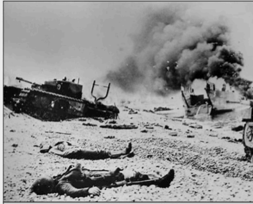
The Dieppe Raid