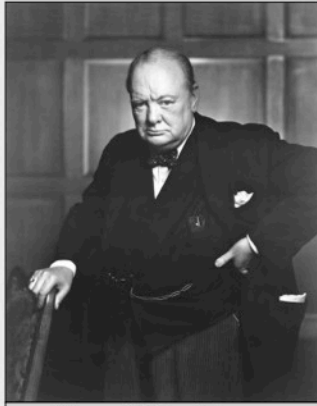
Churchill in Ottawa “The Roaring Lion”