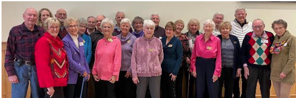
2003-04 Charter and First Year Members.

On February 22, The PROBUS Club of Westside in West Kelowna, British Columbia, celebrated its 20-year anniversary with 80 members, past members, and guests in attendance. Many received recognition including nine Past Presidents and 23 Charter members since 2003.