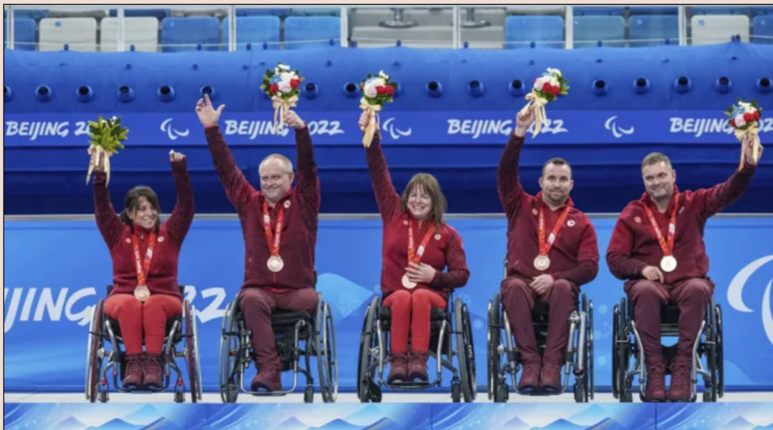
The Team on the Podium