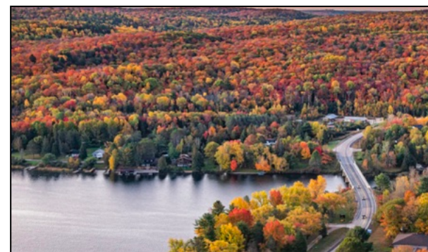
Fall Colours Car Tour