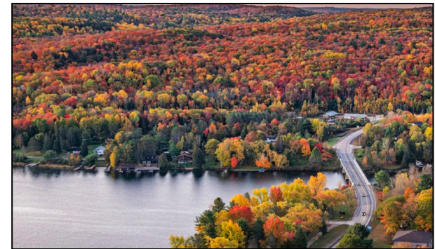
Fall Colours Car Tour